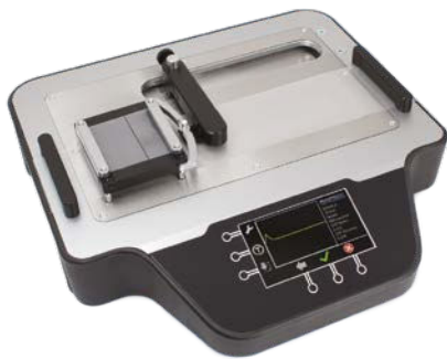
Instrument and connection cables