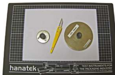
Sample template cutter for 50mm and 115mm \varnothing included with instrument. Suitable for low volume testing.